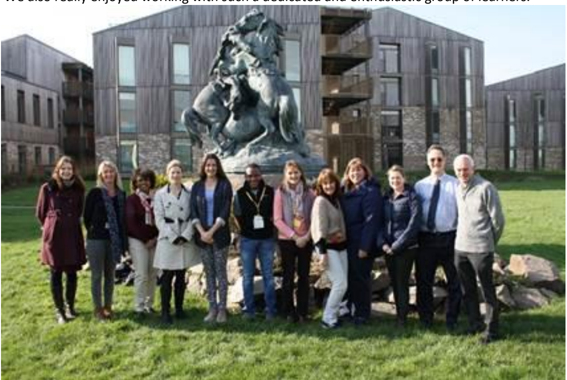
The residential participants plus some of the course tutors and administrators.

We also really enjoyed working with such a dedicated and enthusiastic group of learners.