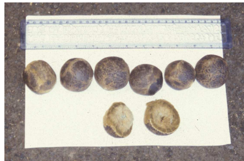
Figure 1. The seven hairballs, lined up beside a 30cm (12") ruler, removed from the rumen of the second goat at post mortem. Each hairball was approximately 5cm in diameter and had a thin hard leathery outer shell.

Within a few days the third goat, an adult female, stopped eating and a decision was made to perform a rumenotomy. The goat weighed 28kg (Figure 2) and