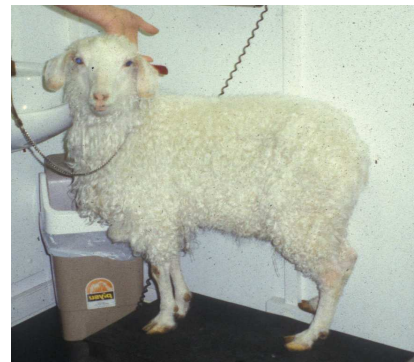
Figure 2. The third goat just prior to surgery.

was operated on under xylazine (0.2mg/kg, Rompun, Bayer) and ketamine (10mg/kg, Vetalar, Pfizer), with local anaesthetic along the line of incision and additional gaseous anaesthetic (Halothane, Merial) available as required. During the rumenotomy (Figure 3) five complete hairballs were removed along with several mats of hair. Post operatively the goat was given buprenorphine (10µg/kg, Vetergesic, Alstoe) for pain relief and antibiotic cover (Clamoxyl LA, Pfizer). The goat made an uneventful and full recovery.